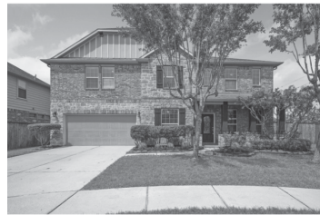
14831 WORTHAM STREAM $419,000

Ryland Build, 5 Beds, 3.5 Baths, Cul-de-Sac, Tankless Water Heater, PEX Plumbing, New Carpet