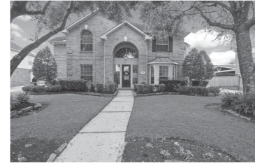
14706 BIRCH ARBOR $539,000

Ryland Build, 5 Beds, 3.5 Baths, Cul-de-Sac, Tankless Water Heater, PEX Plumbing, New Carpet